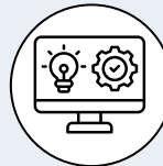
Tech / Software

When people think of R&D, they think of lab coats and test tubes. However, when it comes to the tax code, the definition of what can qualify as R&D is more expansive and includes industries such as: